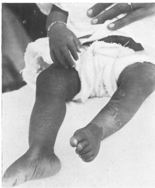
FIG. 6.—Case 4, convalescent.

Fig. 6 shows the child convalescent at the age of 15 months. The wrinkling