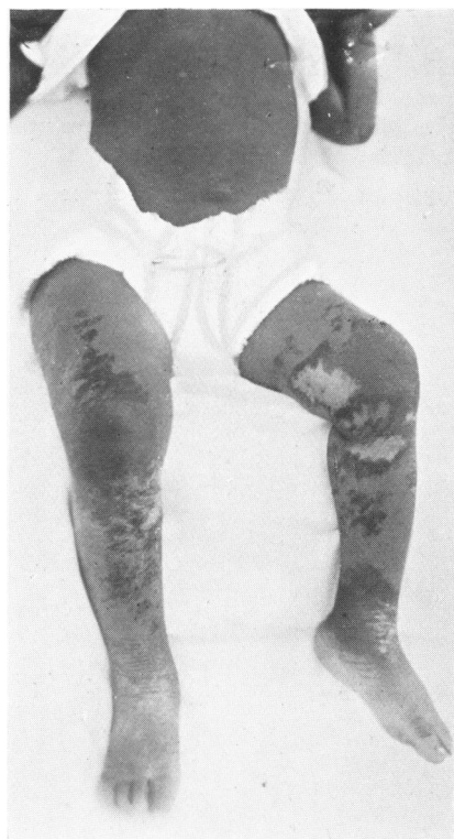
FIG. 5.—Photograph of Case 3, taken three days before death.

Treatment: olive oil to the skin; cod-liver oil and malt, and quinine and iron, with calcium lactate and parathyroid. Marmite, fruit, eggs, arkasa, milk, tomato juice, liverjuice, butter.